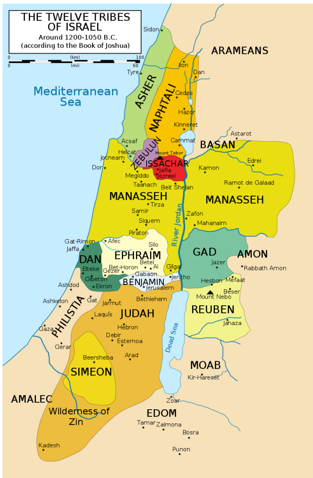
Map to help visualize descriptions of boundaries CLICK TO ENLARGE

It went down (descended) westward to the territory of the Japhletites , as far as the territory of lower Beth-horon(see map above) even to Gezer (see map above - Gezer is further west from Beth-horon), and it ended at the sea (the Mediterranean Sea) - The border went toward the west through the territory of the Japhletites not much of which is known otherwise. This description says ended at the sea (the Mediterranean Sea) but the map above does not show this terminus, but has it ending at the border with Dan.