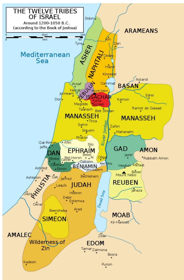
Map to help visualize descriptions of boundaries CLICK TO ENLARGE

It went from Bethel to Luz - Note several versions have " Bethel (that is Luz) " (NLT, NIV). See several dictionary explanations below. In Genesis 28:19 we read "He called the name of that place Bethel ; however, previously the name of the city had been Luz ", Luz being the